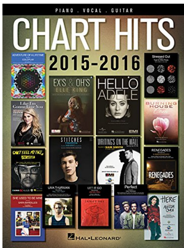
CHART HITS OF 2015-2016 (CHART HITS OF PIANO VOCAL GUITAR) BY HAL LEONARD CORP.

DOWNLOAD EBOOK : CHART HITS OF 2015-2016 (CHART HITS OF PIANO VOCAL GUITAR) BY HAL LEONARD CORP. PDF